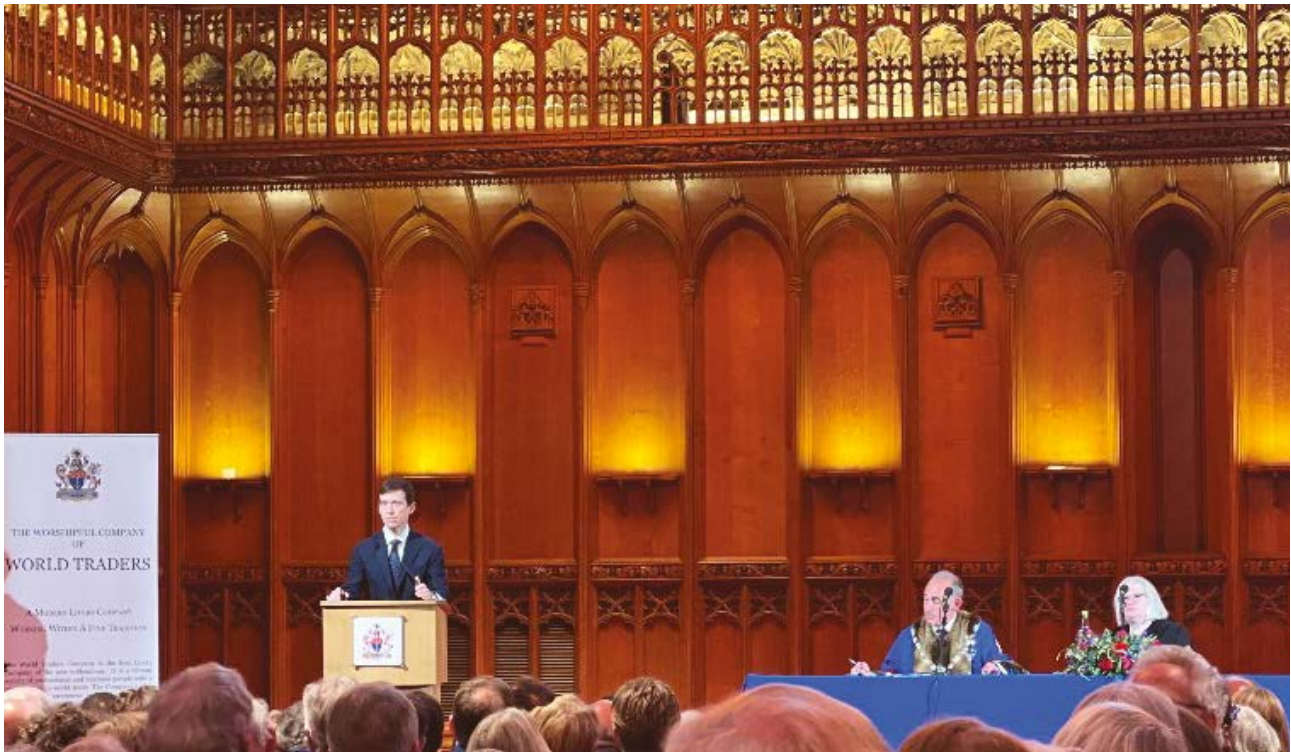
The former International Development Secretary, Rory Stewart OBE , called for firms to do more to tackle global poverty at an event sponsored by the London Chamber