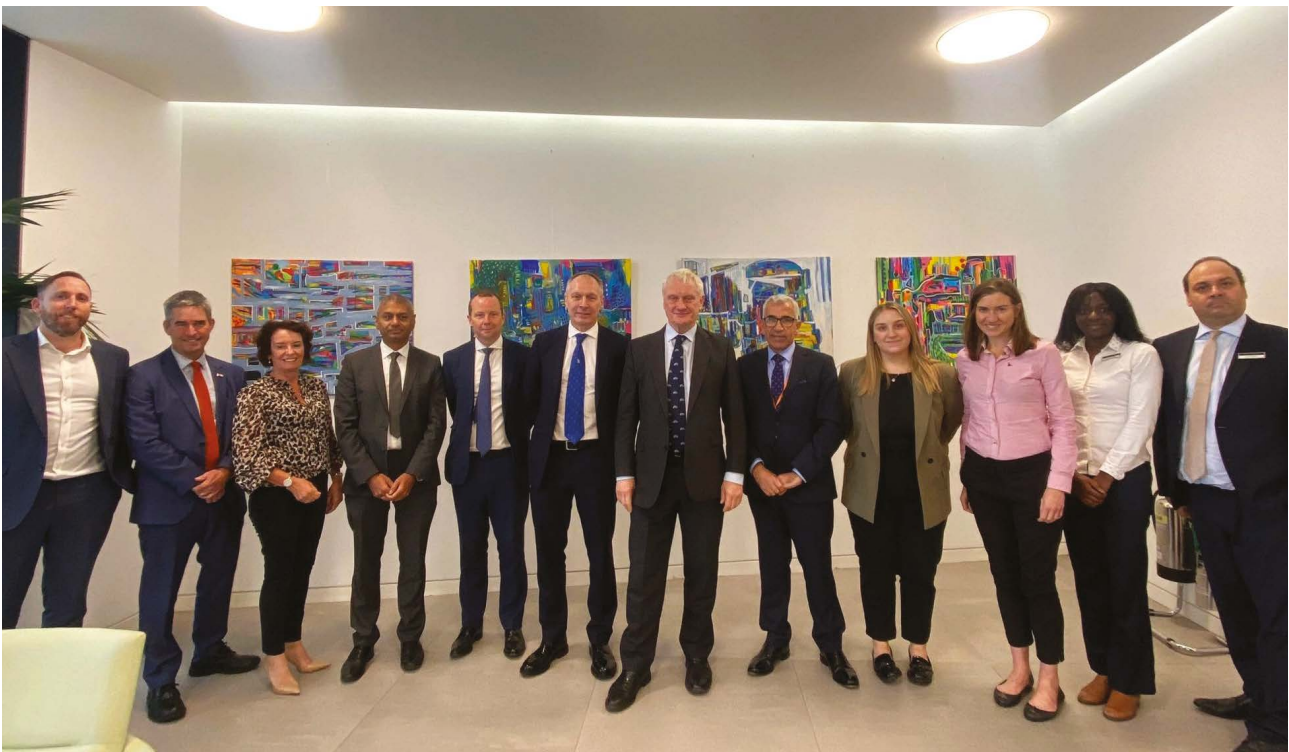
London Chamber members met the Energy Minister, Graham Stuart MP , to discuss the need for Government to work with business in the vital need to meet net zero targets.