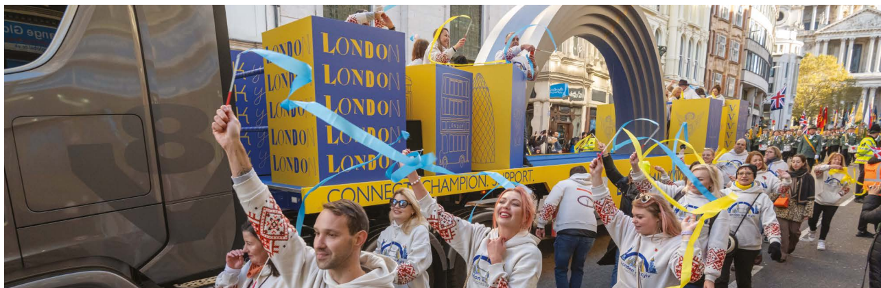
London Chamber float at the City of London's Lord Mayor's Show

The float's design incorporates the bright colours of the Ukrainian flag, a mirror reflecting the City of London as a powerful statement of the established relationship between London and Kyiv, and the Arch of Freedom of the Ukrainian People with a golden crack. In the Arch of Freedom in Kyiv, the crack symbolises the tensions between Russia and Ukraine, whilst the golden crack in the arch on the float represents the strong support between the people of the United Kingdom and Ukraine. Ukrainian refugees were on the float and walking beside the float.