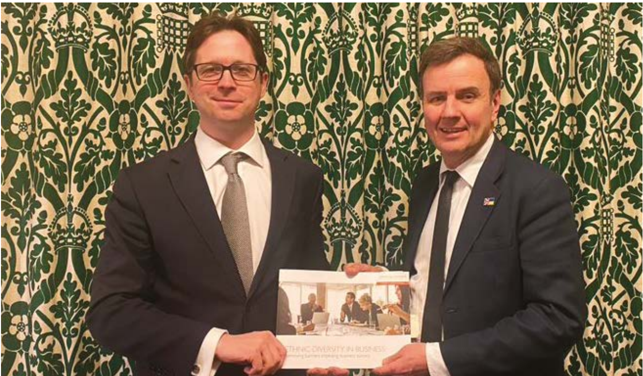
Chelsea and Fulham MP, Greg Hands discussed our report with the Procurement Minister, Alex Burghart MP

Wimbledon MP, Stephen Hammond, raised our report on the need to improve access for procurement contracts for ethnic minority owned firms in the House of Commons with the Business Minister, Kevin Hollinrake MP