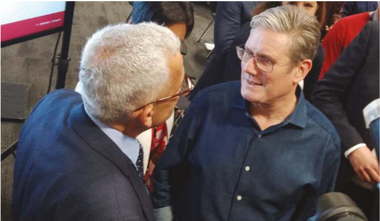
Interim London Chamber CEO, Karim Fatehi MBE met the Leader of the Opposition, Sir Keir Starmer MP , at the Labour Party conference

London Chamber's Parliamentary and Regulatory Affairs Manager, Esenam Agubretu, spoke alongside Shadow Minister for Equalities and Labour Party Chair, Anneliese Dodds MP at an event held at the Labour Party conference. Esenam called for a future Labour Government to support ethnic minority owned businesses telling the Shadow Minister and Labour delegates "Labour cannot reach its mission of Britain leading in the G7 if people from ethnic minorities are excluded".