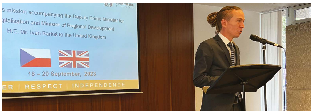
Czechia Deputy Prime Minister, Ivan Bartoš and the London Chamber worked together to consider how to improve Czech – UK trade relations