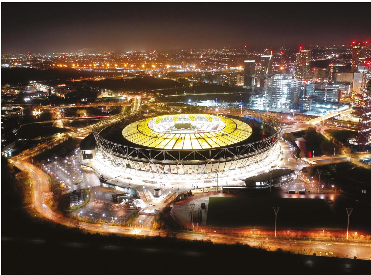
London Chamber backed the successful bid for Wembley and Tottenham Hotspur stadia to host games for the 2028 European football championships