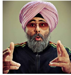
Guest speaker Hardeep Singh Kohli, award winning broadcaster, comedian, writer and chef

We welcome Sir Vince as our guest speaker whose top priorities are fighting to make sure the UK remains at the heart of the EU, increasing access to finance for businesses and investing in high quality public services.